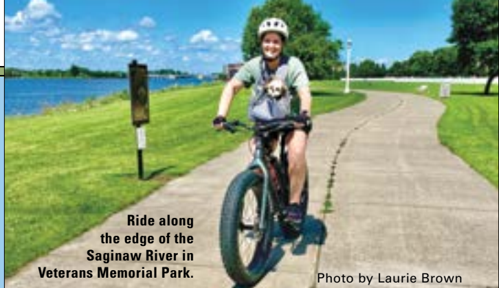
Ride along the edge of the Saginaw River in Veterans Memorial Park.